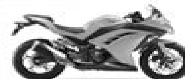
How to Remove the Rear Wheel