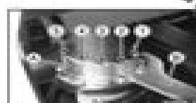
A. Spring Preload Adjuster B. Arrow

Turn the adjuster counterclockwise to increase spring preload and stiffen the suspension. Turn the adjuster clockwise to decrease preload and soften the suspension.