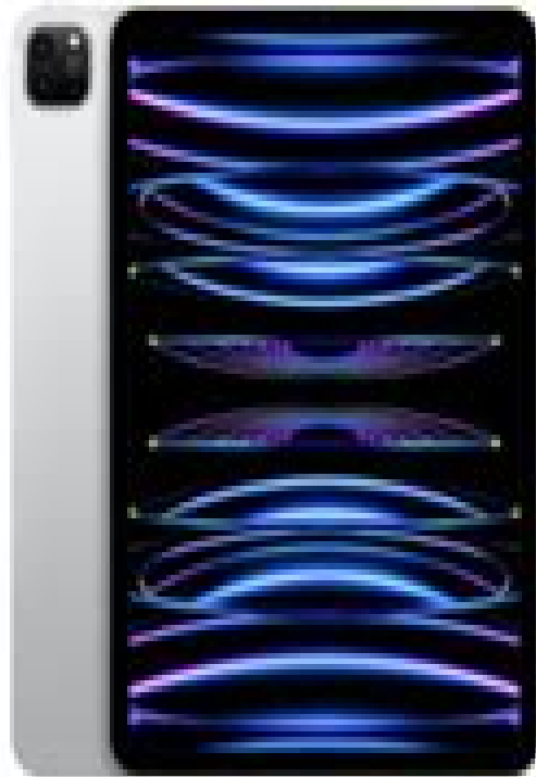
Refurbished 11-inch iPad Pro Wi-Fi 128GB Silver (4th Generation)