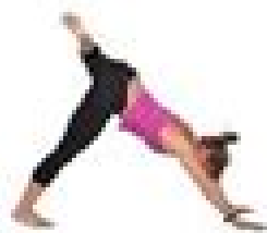
Knee Circle (step 1)