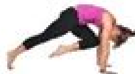
Knee to Nose