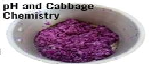
pH and Cabbage Chemistry