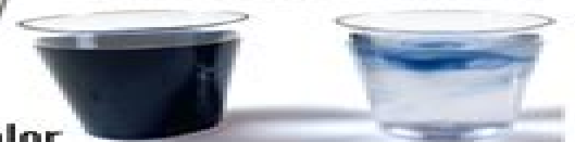
Iodine Clock Reaction