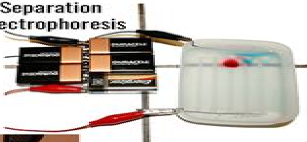
Color Separation Gel Electrophoresis