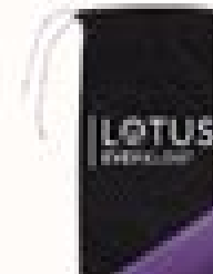
lavender eye pillow