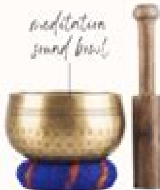
meditation sound bowl