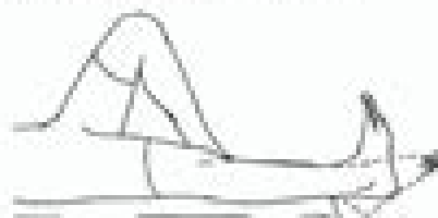
ANKLE / FOOT - 18 ROM Flexion / Dorsiflexion

With OPERATED leg extended, gently flex and extend ankle to move through full range of motion. Avoid pain.