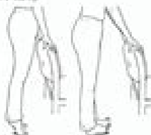
GAIT - 1 Toe Up

Gently raise toe up on heel and lower slowly.