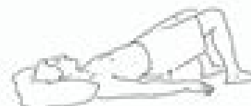
TRUNK STABILITY - 4 Bridging

Slowly raise buttocks from floor, keeping stomach tight.