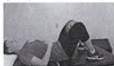
Heel Ball Squeeze

While flexing with a neutral spine, squeeze a ball or towel roll firmly between your heels. Hold the squeeze for 3-5 seconds. Do 10 repetitions per set. Do 1 set per session. Do 1-2 sessions per day.