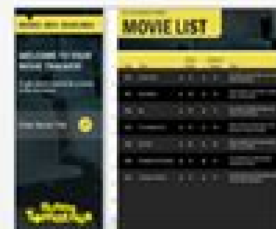
Movie list app