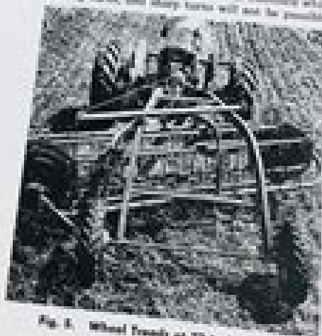
Fig. 1. Internal Pressure at 70 Inch. Section

Although the take can be attached to any type of drawing that will take a single "A" block body pin, it is obvious that certain types of drawing may require optimum take position. If for instance a straight drawing is used, tape will have to be removed while making turns, and sharp turns will not be possible.