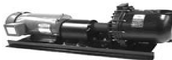
Electric Drive long-coupled