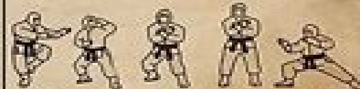
HICHO KOSEI JUMONJI HENKA JUMONJI KIHON IHEN HOGI