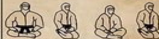
SUWARI GATA SEIZA FUDOZA SEIZA