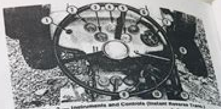
Fig. 2—Instruments and Controls (Instant Reverse Trans.)