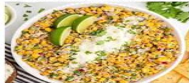
MEXICAN CORN SALAD