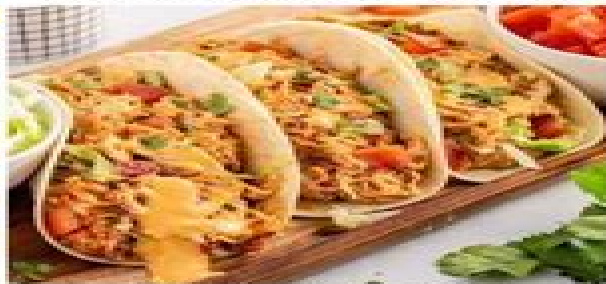
QUESO CHICKEN TACOS