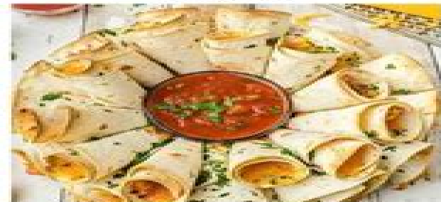
BLOOMING QUESADILLA RING