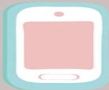
go screen free for 30 minutes