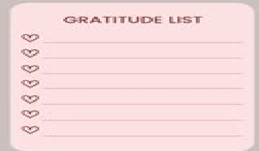
5 minute journal