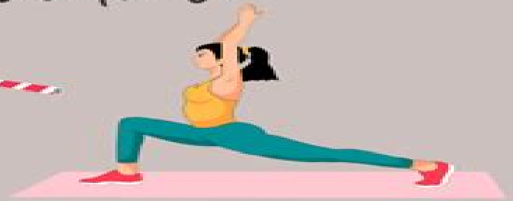
10 minute stretch