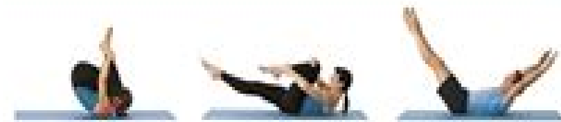
4 Rolling Like a Ball (0:40-1:00)