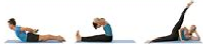
16 Double Leg Kick (0:30-1:00)