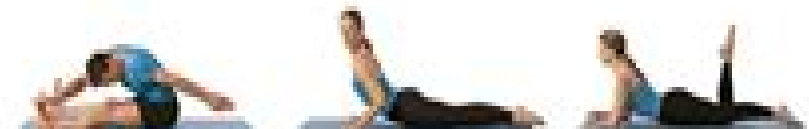
13 Saw (0:40-1:00)