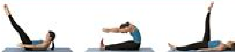
1 The Hundred (0:40-1:00)

Building on the exercises in the preceding chapter, the Intermediate Programme adds several new exercises to your workout. This exercise sequence chart provides a visual cue card: when performed in the order shown, the entire programme will flow smoothly and easily. As you progress, you should need to refer only to the chart to complete your workout.