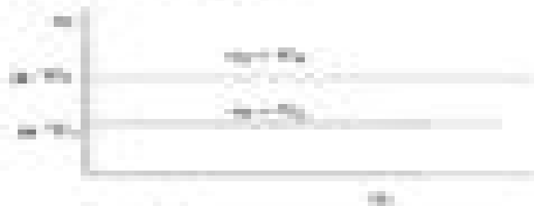
Fig. 14-8b (b)

LO 14-3 Explain the importance of controlling and how it relates to the budgeting process and budgetary control systems (see Fig. 14-8b).