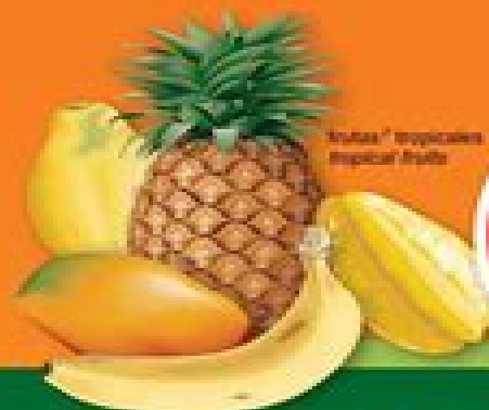
frutas f tropicales tropical fruits