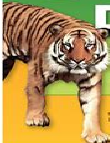
tiger tigre m

50,000 translations in Spanish and English with 1,000 full-color illustrations