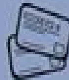
Federal student loans