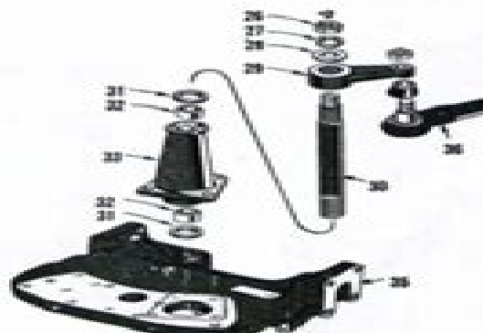
Fig. MF9 — Exploded view of the upper pedestal and components used on model MF45 with manual steering.

Remove the nut (26—Fig. MF9) retaining steering arm (29) to pedestal shaft and remove the steering arm. Remove pedestal shaft (30), examine all parts and renew any which are damaged or show wear. Ream new bushings (32), after installation, to an inside diameter of 1.5005-1.5015. Pedestal shaft (30) should have a clearance of 0.0005-0.002 in the bushings.