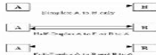
Fig. 3 different types of serdes cores

SerDes cores which contain only transmit or only receive channels are called simplex cores; SerDes cores which contain both transmit and receive channels are called full duplex cores. Note that the terminology "full duplex" does not imply that the electrical interface is bidirectional. Any given electrical interconnect channel has a fixed direction of data transmission. If a protocol application requires "full duplex" communication, then independent transmit and receive channels with independent interconnections are used to implement the interface.