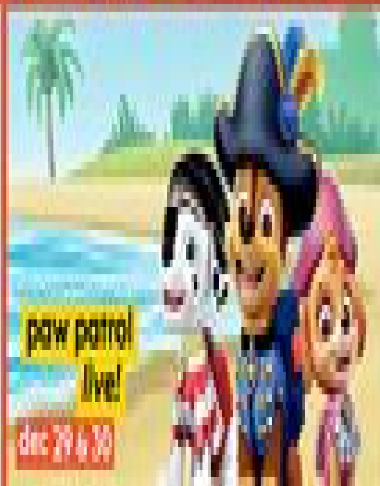
paw patrol live!