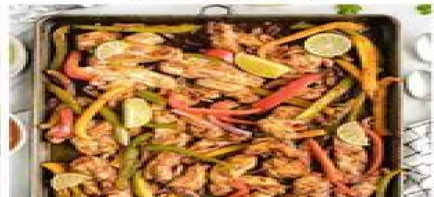
SHEET PAN FAJITAS