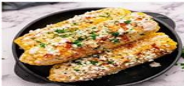
ELOTE - MEXICAN STREET CORN