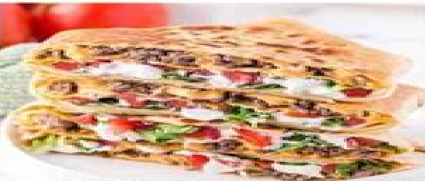
COPYCAT CRUNCHWRAP SUPREME