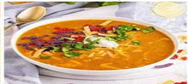
CHICKEN ENCHILADA SOUP

FIND ALL RECIPES AT: HTTPS://PRINCESSPINKYGIRL.COM/