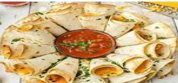
BLOOMING QUESADILLA RING