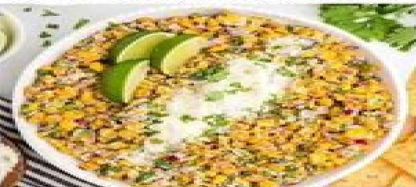
MEXICAN CORN SALAD