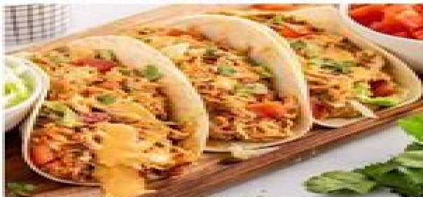
QUESO CHICKEN TACOS