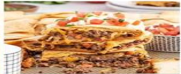
SHEET PAN TACOS