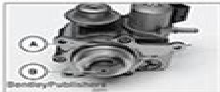
High pressure fuel system service on turbo engine, including replacing in-fuel pump, E40 Fuel Tank and Fuel Pump