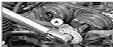
Detailed engine service, including VANOS camshaft timing adjustment, N12 Camshaft Timing Check