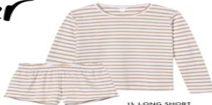
13. LONG SHORT PAJAMA SET