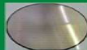
700um support silicon wafer