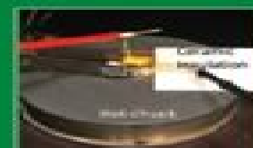
SiC PIN Diode test setup