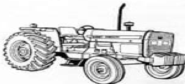
M-F 300 series