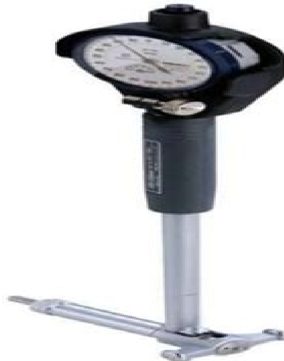
Fig 2. Dial bore gauge

The instrument basically consists of a hollow tube into which is contained a lever pivoted about its intermediate support. One end of the lever is linked to the movable contact point of the instrument and the other end of the lever actuates the dial indicator. Interchangeable rods and washers can be used in order to broaden the range of measurement.