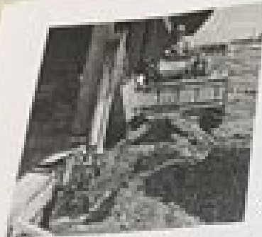
Fig. 21 - Back Sight