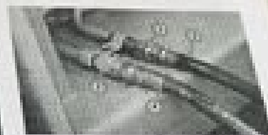
Fig. 26 - Connecting Hydraulic Hoses