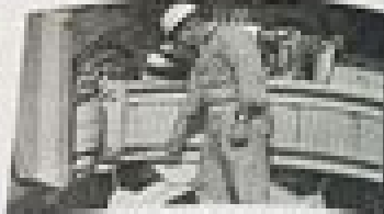
Fig. 22 - Digging the Backhoe into the Right Side of the Trench

When working on a slope, always start at the top and work down. When working across a slope, work full run of the backhoe's operating range. Use the backhoe to level the ground and to level the top of the trench. Always use the full run of the backhoe's operating range.