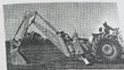
Fig. 27 - Backing into Backhoe