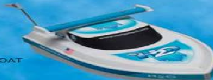
MTC7701 H2O ELECTRIC MINI R/C SPEEDBOAT