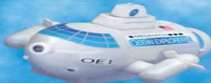
MTC7702 OCEAN EXPLORER 1 R/C SUBMARINE