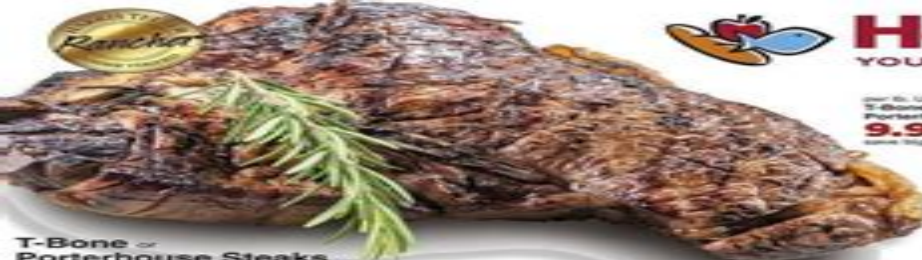
T-Bone or Porterhouse Steaks