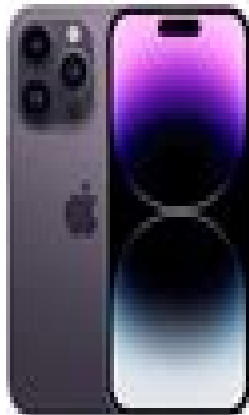
iPhone 14 Pro