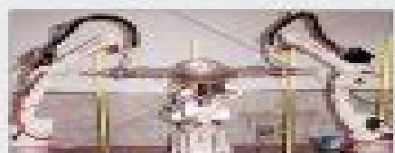
MULTIPLE ROBOT CONTROL