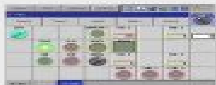
OPTIONAL CUSTOM VIEW