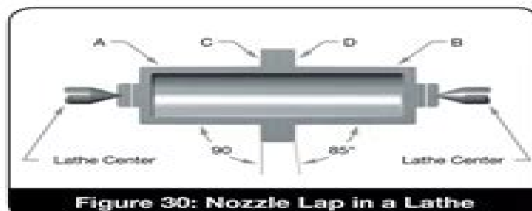
Figure 30: Nozzle Lap in a Lathe

One lapping surface is 90° and the other is 85°. The angle of each surface is marked on the lap. Machine surfaces C and D by taking light cuts at the proper angle until the lapping surfaces are reconditioned.