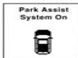
Park Assist System ON

When the vehicle is in REVERSE, the warning display will turn ON indicating the system status.