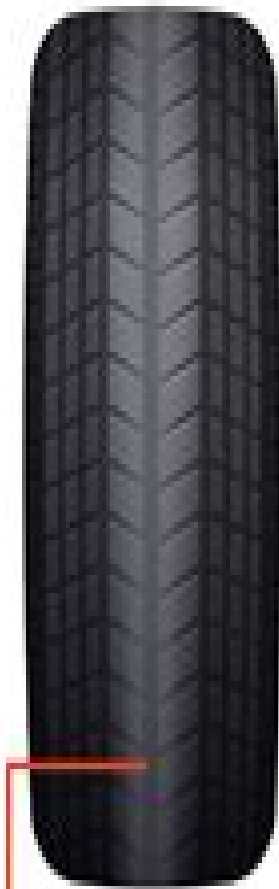
Wear in the Middle