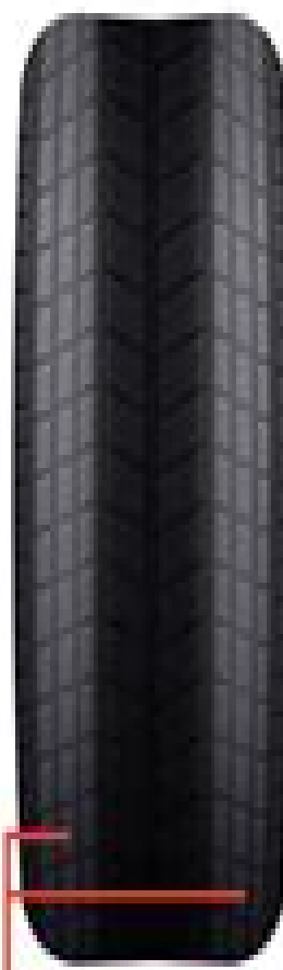
Wear on the Sides