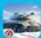
World of Tanks