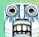
Temple Run 2