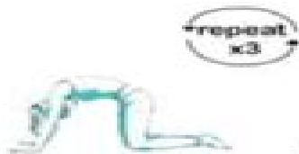
2 Down Dog