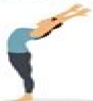
5 STANDING BACKBEND