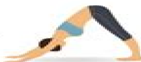
2 DOWN DOG