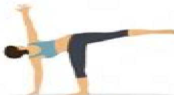
10 HALF MOON