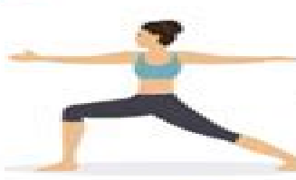
7 WARRIOR II