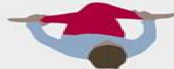
RECLINING COW FACE