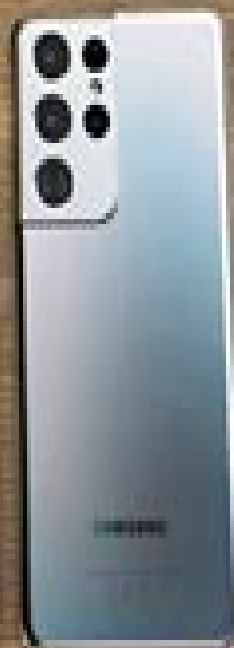
Galaxy S21 Ultra