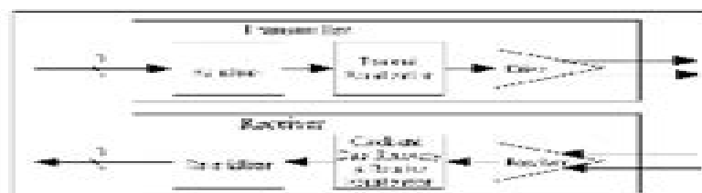
Fig. 2 HSS basic block diagram

High-speed Serializer/Deserializer (HSS) devices are the dominant implementation of I/O interfaces at speed of 2.5 Gbps and higher. Such devices are differentiated from source-synchronous interface in that the receiver device contains a clock data recovery (CDR) circuit dynamically determines the optimal sampling point of the data signal based upon the transition edges of the signal. In other words clock information is extracted directly from the data rather than relying on a separate clock.