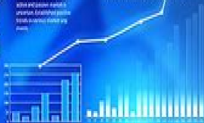
Projected sales of main products in 2011

Comparison of the activity of the major players in the market. The market share of the major players is relatively stable, and the market share of the major players is relatively stable.