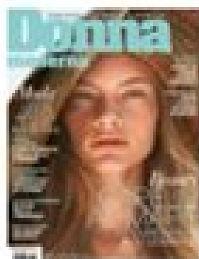
Donna Moderna – 4 Luglio 2024