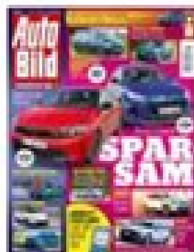
Auto Bild Germany – 4 Juli 2024

We try our best to present you the most recent issues of magazines. Also at our site you can check out the newest 50 issues added for you read at our best resource of magazines. You can also use page navigation at the bottom of the page to find magazines that were added earlier in the order of their appearance on the site. You can easily download the magazine into your android tablet or ipod iphone ipod and enjoy reading it at any time