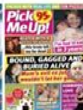
Pick Me Up! – 11 July 2024