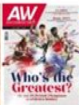
Athletics Weekly – July 2024