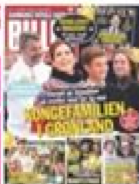
Billed-Bladet – 4 Juli 2024