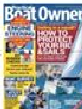
Practical Boat Owner – August 2024