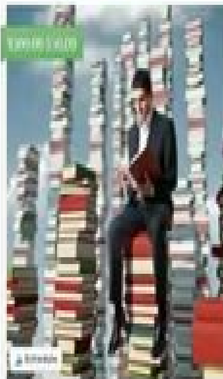
Speed Reading Mastery Course Video based Training