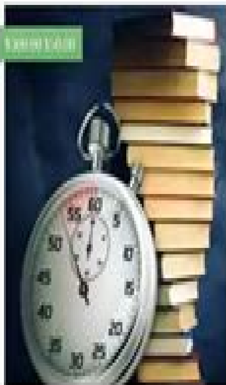
Speed Reading Foundation Course Video based Training