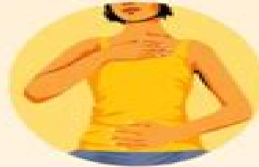
Anxiety relief meditation