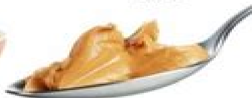
peanut butter 1 tbsp