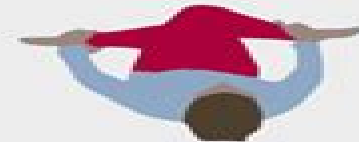
RECLINING COW FACE