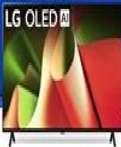
Only at Best Buy