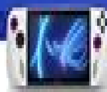
ASUS ROG Ally Z' getting handheld with AMD Ryzen™ Z1 Extreme processor