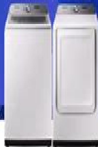
Samsung washer and dryer pair