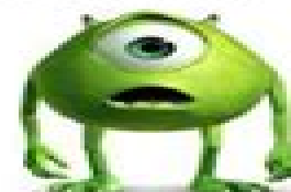
Figure 1 Second Base