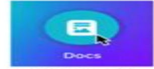
Canva Magic Write