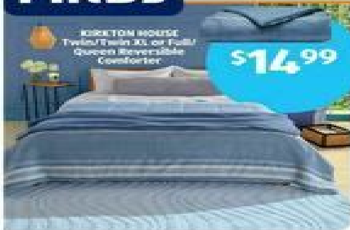
KIRKTON HOUSE Twins/Twin XL or Full/Queen Reversible Comforter

Unexpected products at amazing prices. Get 'em while they last.